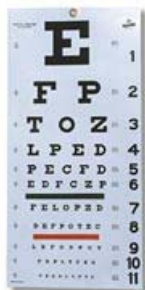
Snellen Eye Testing Chart