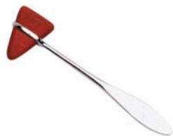
Taylor Neurological Hammer

Single-lumen tubing, non chill rim and patented Littmann soft-sealing eartips Includes two headsets