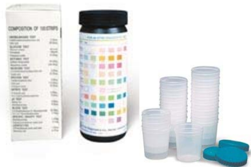
Diagnostic U/A Strips with Specimen Cups